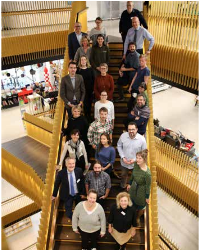
Kick-Off, Odense, 2019

The Corona crisis will also have an impact on the second LTT, which should have been liquidated in Belgium in October 2020. To be on the safe side we have postponed this to January 2021, as we have not been certain that it would be possible to travel across borders in October 2020.